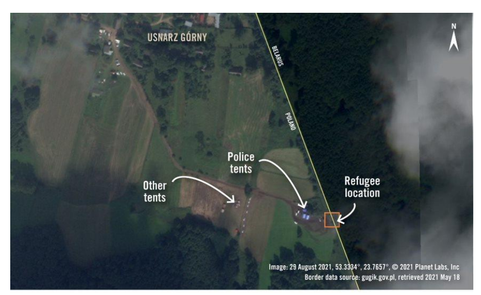
Poland-Belarus Border. 29 August 2021.