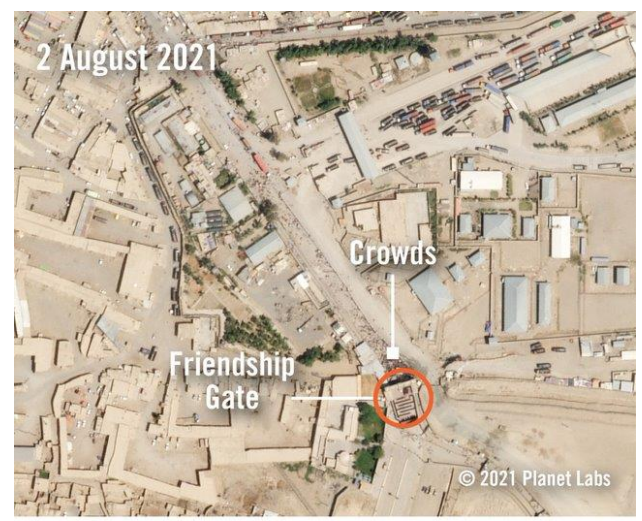
Spin Boldak border crossing. 2 August 2021. Planet Labs.

Afghans who tried to cross land borders, an Afghan researcher, and the UN agency in charge of refugees (UNHCR), all told Amnesty International that the Afghan people were also prevented from seeking refuge abroad because most of the land border crossings were closed for asylum seekers. 185