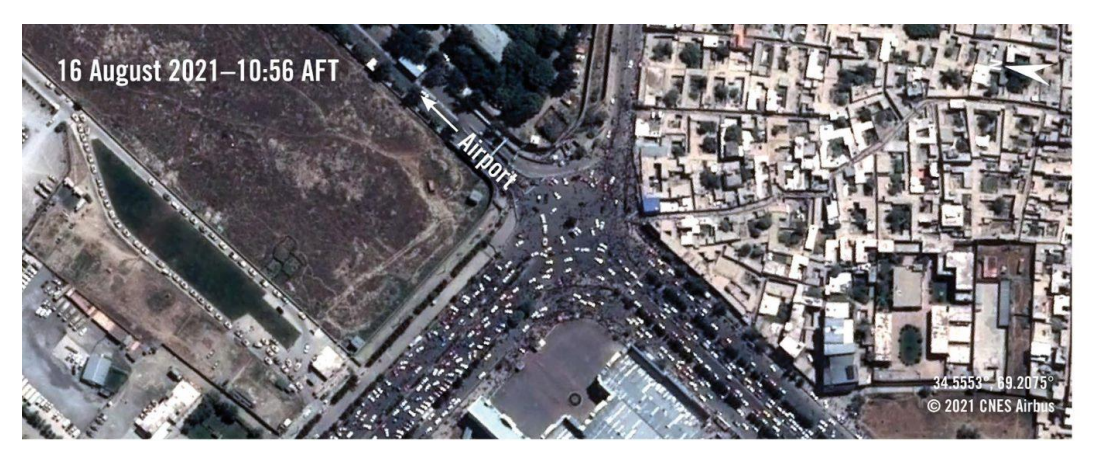
Kabul Airport vicinity. 16 August 2021.

In this report, Amnesty International, International Federation for Human Rights (FIDH) and the World Organisation against Torture (OMCT) have documented incidents of human rights violations that have taken place in Afghanistan since the takeover by the Taliban on 15 August. This report calls on the UN Human Rights Council (UNHRC) to take decisive action to establish a robust independent investigative mechanism to monitor and report on human rights abuses committed in violation of international human rights law, and to contribute to accountability for crimes under international law. Human rights defenders, journalists, and others who are targeted for their work must be evacuated and given safe passage if they wish to leave Afghanistan; and women and girls, and ethnic and religious minorities who are targeted because of their gender, ethnic, and religious identity, must be guaranteed protection. All those who wish to leave Afghanistan must be assured the right to seek asylum. At the same time, the Office of the Prosecutor of the International Criminal Court must receive assistance from the international community to immediately recommence its investigations into crimes under international law committed in Afghanistan.