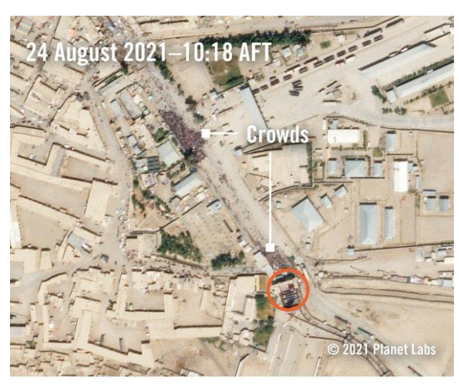
Spin Boldak-Chaman crossing. 24 August 2021.

For instance, according to UNHCR, Pakistan closed its border with Afghanistan, except for people in need of medical treatment, or with a proof of residency. Despite that, at the Spin Boldak-Chaman border crossing in Kandahar, people with Tazkira (National ID Card) from Kandahar, Helmand, Zabul, and Uruzgan were allowed to cross the border. Between 2 August 2021 and 24 August 2021, the crowds attempting to cross the border to Pakistan via the Spin Boldak crossing increased exponentially, as documented via satellite imagery (see above) and video analysed by Amnesty International.