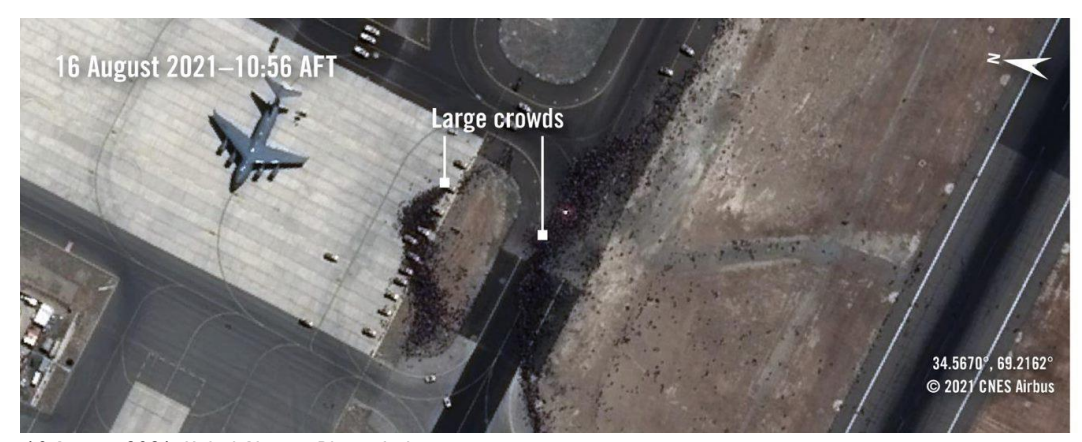
16 August 2021. Kabul Airport.

The thousands who are left behind, or are trying to leave Afghanistan, are testament to the brutal regime of the Taliban circa 2001, when extrajudicial executions abounded, and women and girls were oppressed with a plethora of restrictions. Since then, even in the last 20 years, the Taliban and other armed groups have conducted brutal attacks on civilians, journalists, human rights defenders, and government workers, resulting in Afghanistan having one of the highest civilian deaths in the world. Nearly 50,000 civilians have died in the last 20 years. The first half of 2021 alone recorded 5183 civilian casualties (1,659 deaths and 3,524 injuries), of which 32 per cent were children. This is a 47 per cent increase in civilian casualties compared to the same period in 2020. Those responsible for these casualties include both anti-government and pro-government forces.