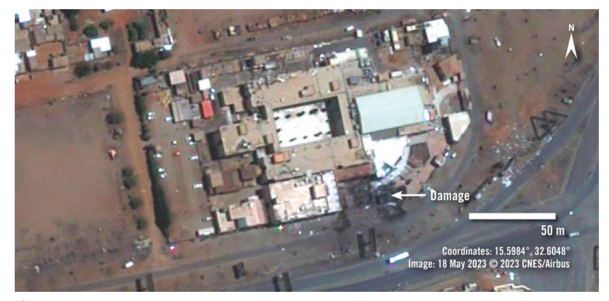
^{\odot} ^{\circ} On 18 May 2023, imagery shows the south side of the hospital has been heavily damaged.

In its letter to the RSF leadership, Amnesty International asked questions about how its forces were making decisions about where to locate themselves when operating in densely populated areas, and about what precautions they were taking to protect civilians from the dangers of their locations and of their operations more generally.